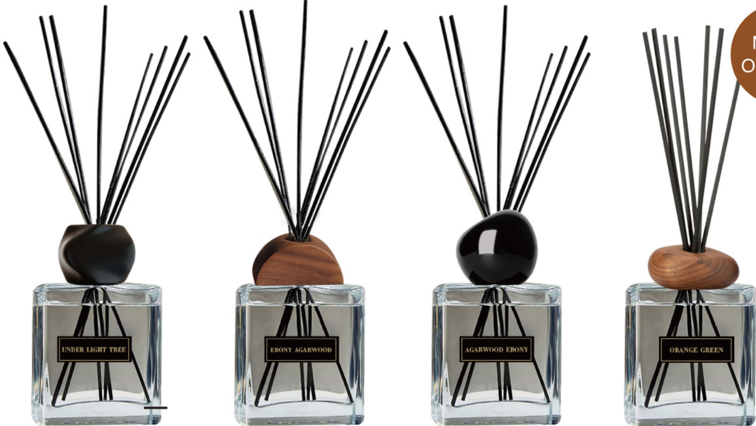
Fragrance: Under Light Tree